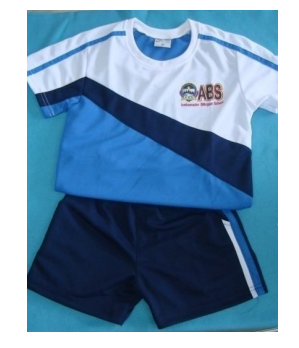
P.E. Uniform (blue & white